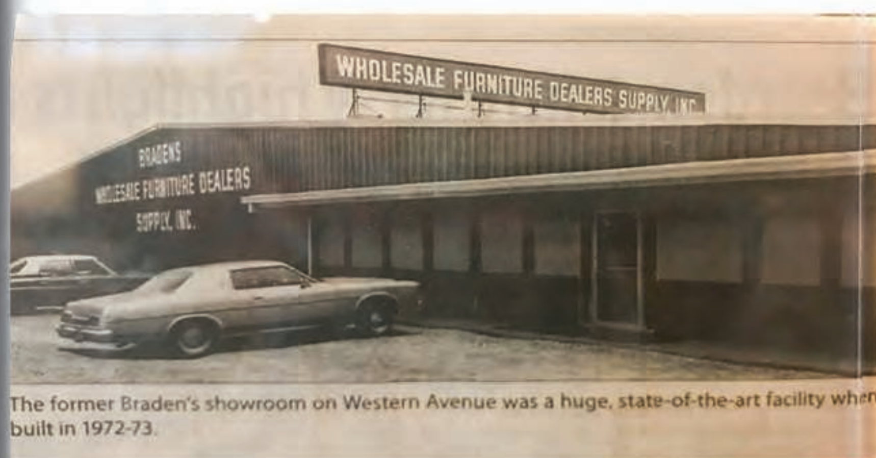
The former Braden's showroom on Western Avenue was a huge, state-of-the-art facility when built in 1972-73.